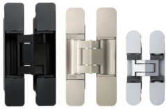
Concealed Hinges HES3D Series