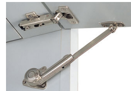
Soft-Down Stays NSDX