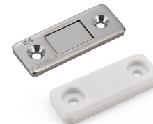
Magnetic Catches MC-159, MC-JM45, MC-JMF54