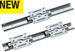
Multi-Roller Linear Guide MLGX25, MLGX-25C-8