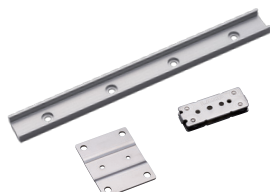
Multi-Roller Linear Guide MLG20, MLG-20C, MLG-20-P55-40