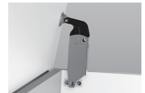
Balance Adjustable Spring Loaded Lid Stay S-ATJ