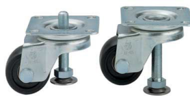
Caster With Leveling Glide AF-65