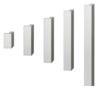
Extruded Aluminium Handles ALH