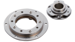
Swivel Torque Hinges HG-S Series