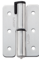
Lift-Off Torque Hinges HG-KNT