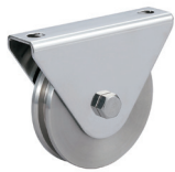
Bearing Rollers (HD) JS300