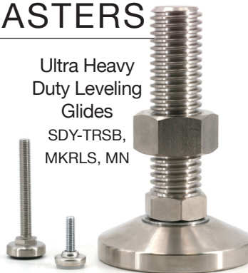
Ultra Heavy Duty Leveling Glides SDY-TRSB, MKRLS, MN