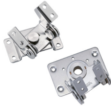
Dual Axis Torque Hinges HG-T30S15, HG-T70S30