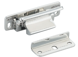
Stainless Steel Lever Latches LL-66S