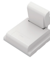
Power Assist Hinges HG-PA Series