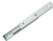
Aluminum Mini Slides AR3-16