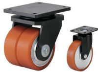
High Durability Urethane Wheels