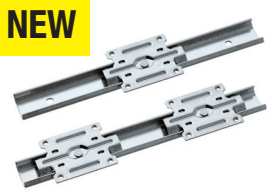
Multi-Roller Linear Guide MLGX25, MLGX-25C-8