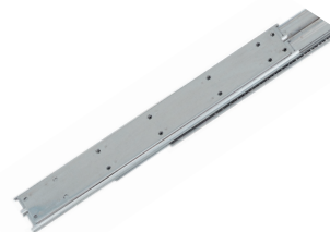
Full Extension Slides ESR-10